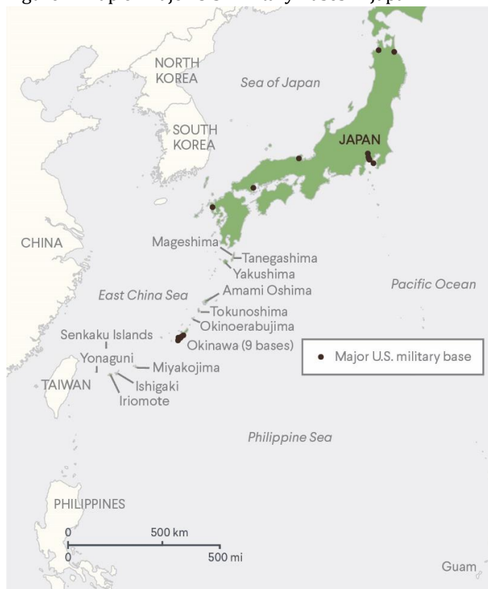
Figure 1. Map of Major U.S. Military Bases in Japan